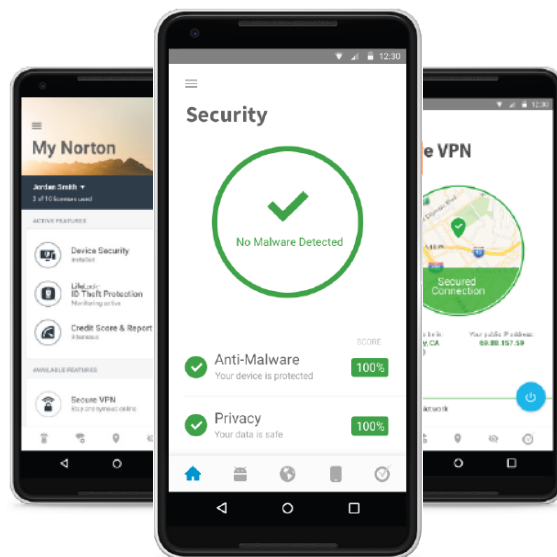
Screens are for demonstration purposes only.

Cybercriminals can meet anonymously on dark web sites to make illegal purchases of personal information. Dark Web Monitoring 3 continuously patrols the dark web and private forums looking for personal information. We send you notifications should it be found.